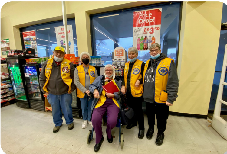
Lions helping kids to shop for Christmas.