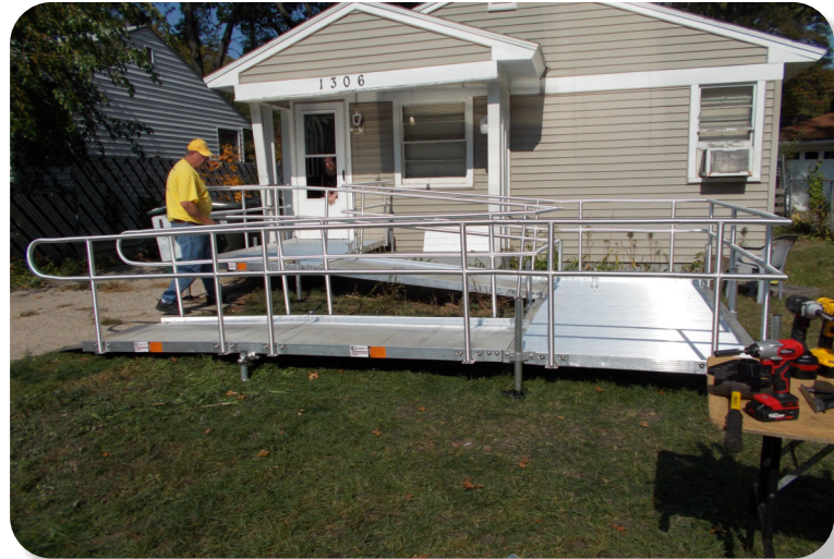
Our Ramp Crew is versatile, they will assemble aluminium ramps too.