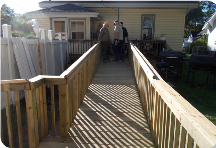
Lions building wooden ramps.