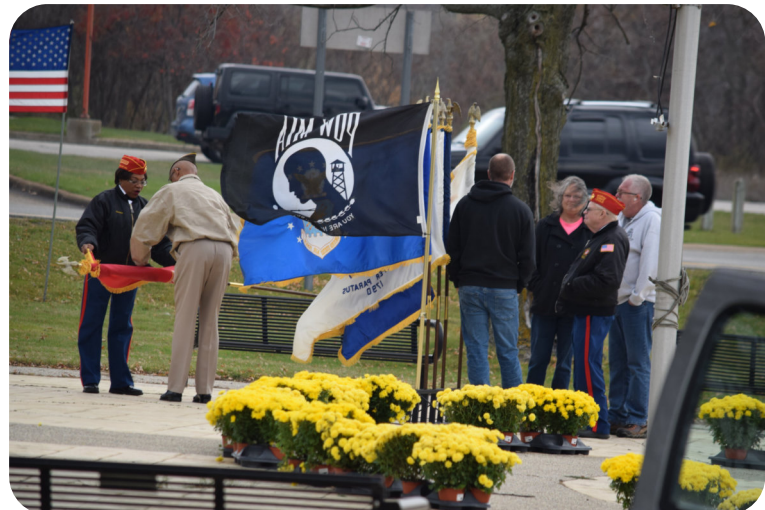
During the Veterans Day, the Vets turn out, on the Causeway.