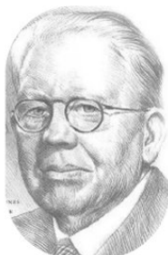
Melvin Jones Founder

Meets 1st and 3rd Wednesdays at 6:30pm Ravenna Conservation Club