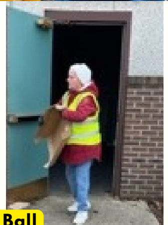
FOOD TRUCK PHOTOS