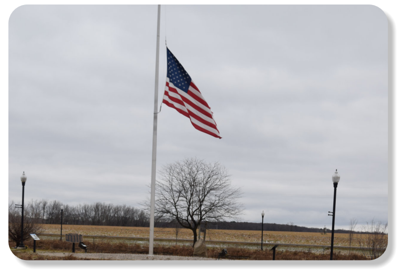
The Flag flying at Veterans Park, on Veterans Day.