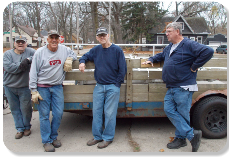
Even in November our Ramp Crew answers the call.

Living our Mottos - We Serve - "We Do It Better - Together!"