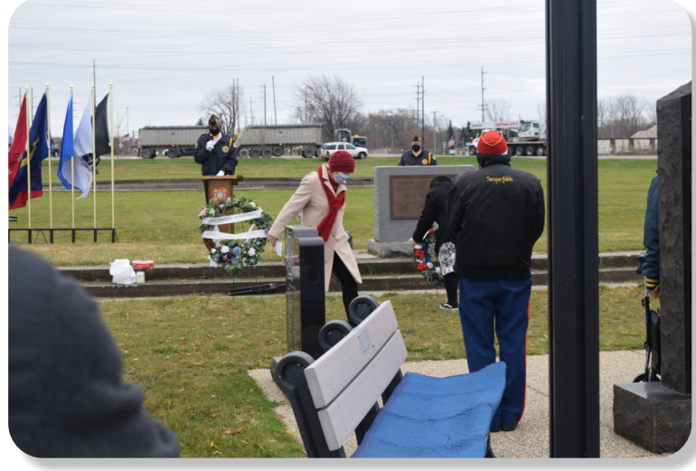
The Park offers a great place to honor those who have served.