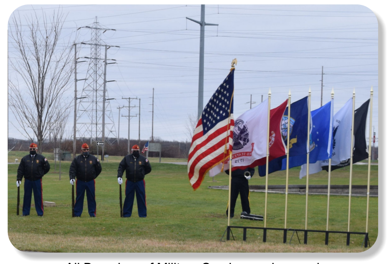
All Branches of Military Service are honored.