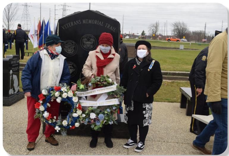
Even in the cold, the ceremony continues.