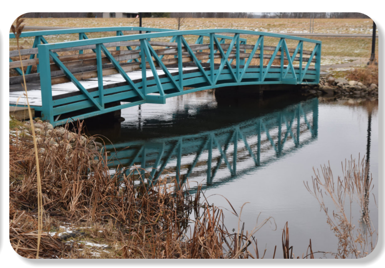
This project has dressed up Veterans Park.